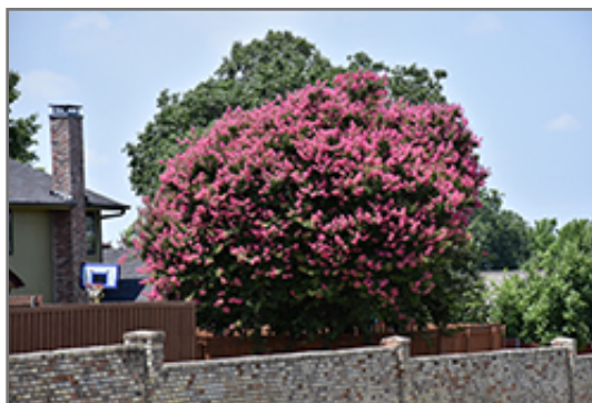
Zuni Crapemyrtle in bloom