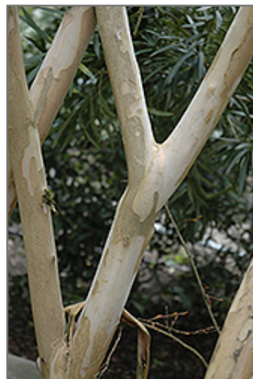
Zuni Crapemyrtle bark

* This is a 'special order' plant - contact store for details