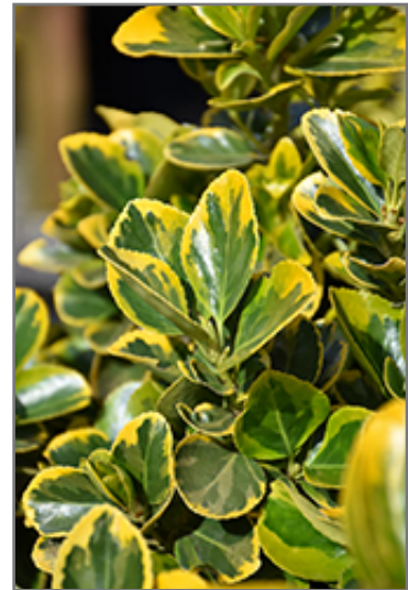
Gold Variegated Japanese Euonymus foliage