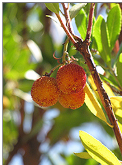
Dwarf Strawberry Tree fruit