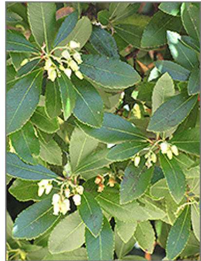
Dwarf Strawberry Tree flowers

* This is a 'special order' plant - contact store for details