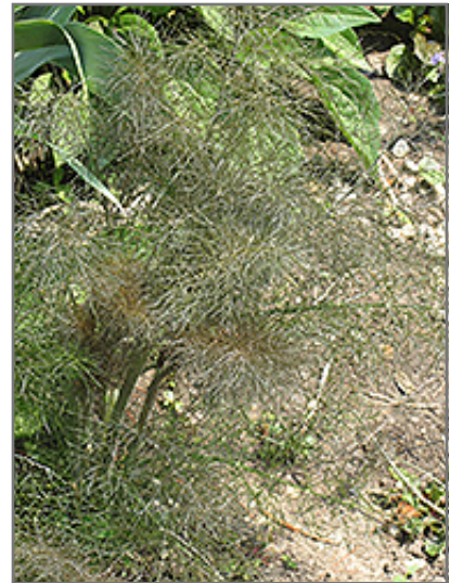
Purple Fennel