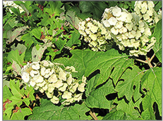
Snow Queen Hydrangea flowers

This shrub performs well in both full sun and full shade. It prefers to grow in average to moist conditions, and shouldn't be allowed to dry out. It is not particular as to soil type or pH. It is somewhat tolerant of urban pollution, and will benefit from being planted in a relatively sheltered location. Consider applying a thick mulch around the root zone in winter to protect it in exposed locations or colder microclimates. This is a selection of a native North American species.