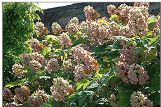
Snow Queen Hydrangea flowers