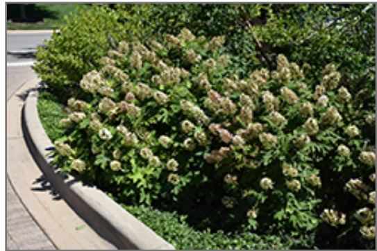
Snow Queen Hydrangea in bloom

Snow Queen Hydrangea is recommended for the following landscape applications;