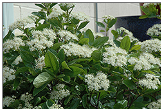
Winterthur Viburnum flowers

This is a relatively low maintenance shrub, and should only be pruned after flowering to avoid removing any of the current season's flowers. It is a good choice for attracting birds to your yard, but is not particularly attractive to deer who tend to leave it alone in favor of tastier treats. It has no significant negative characteristics.