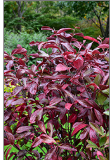
Winterthur Viburnum in fall

This shrub does best in full sun to partial shade. It prefers to grow in average to moist conditions, and shouldn't be allowed to dry out. It is not particular as to soil type or pH. It is highly tolerant of urban pollution and will even thrive in inner city environments. Consider applying a thick mulch around the root zone in winter to protect it in exposed locations or colder microclimates. This is a selection of a native North American species.