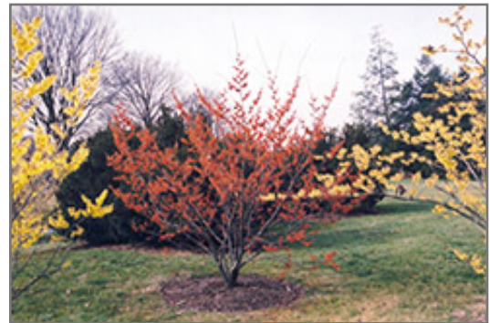
Diane Witchhazel in bloom