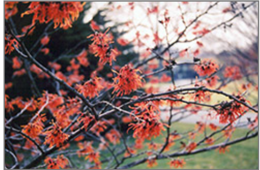
Diane Witchhazel flowers

Diane Witchhazel is recommended for the following landscape applications;