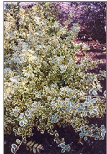
Canadale Gold Wintercreeper