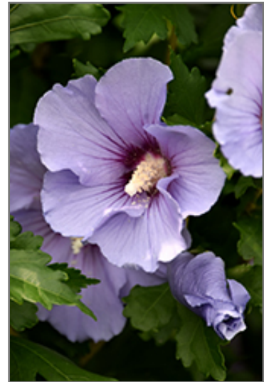
Blue Satin Rose of Sharon flowers

Blue Satin Rose of Sharon is recommended for the following landscape applications;