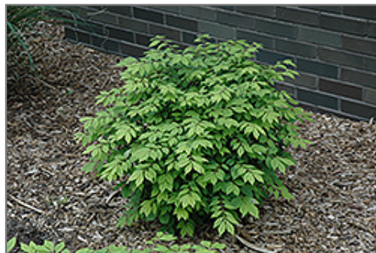
Little Moses Burning Bush