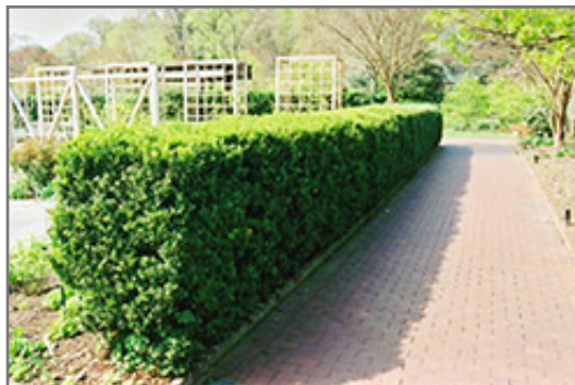
Common Boxwood