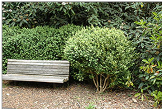
Common Boxwood