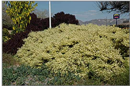
Moonlight Scotch Broom in bloom