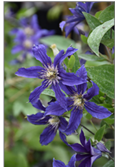
Sapphire Indigo Clematis flowers