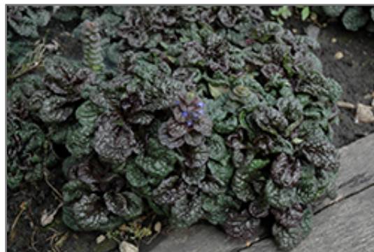
Metallica Crispa Bugleweed