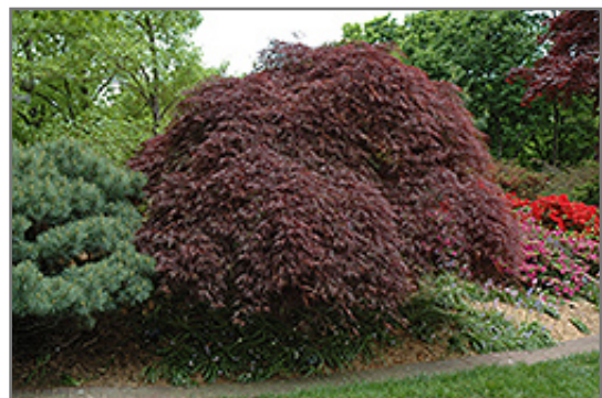
Red Select Cutleaf Japanese Maple