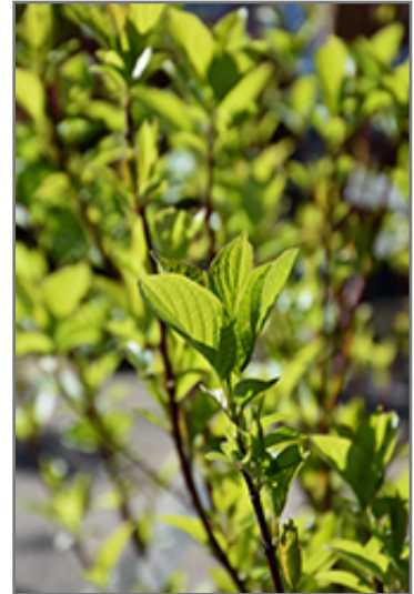
Bailey Red-Twig Dogwood foliage

* This is a 'special order' plant - contact store for details