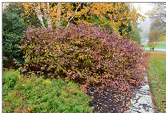
Bailey Red-Twig Dogwood in fall