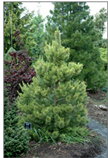
Gold Coin Scotch Pine

This is a relatively low maintenance tree. When pruning is necessary, it is recommended to only trim back the new growth of the current season, other than to remove any dieback. Deer don't particularly care for this plant and will usually leave it alone in favor of tastier treats. It has no significant negative characteristics.