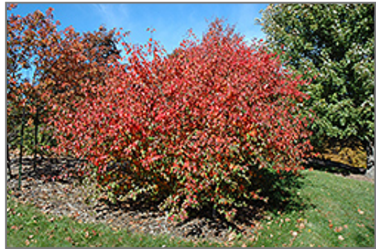
Korean Sun Pear in fall

Korean Sun Pear will grow to be about 15 feet tall at maturity, with a spread of 20 feet. It has a low canopy with a typical clearance of 2 feet from the ground, and is suitable for planting under power lines. It grows at a medium rate, and under ideal conditions can be expected to live for 50 years or more.