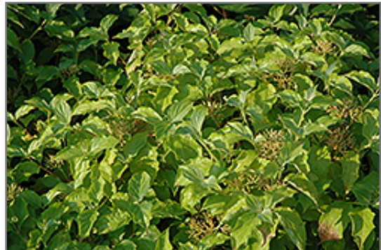
Arctic Sun Dogwood foliage