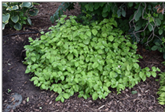
Arctic Sun Dogwood