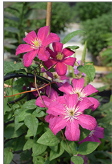
Barbara Harrington Clematis flowers