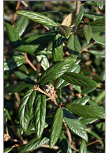
Prague Viburnum foliage

This shrub does best in full sun to partial shade. It prefers to grow in average to moist conditions, and shouldn't be allowed to dry out. It is not particular as to soil type or pH. It is highly tolerant of urban pollution and will even thrive in inner city environments. This particular variety is an interspecific hybrid.