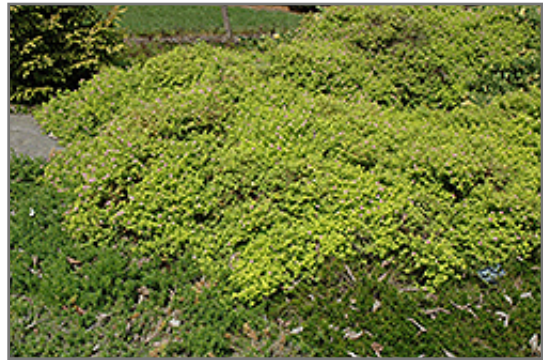
Golden Elf Spirea

Golden Elf Spirea is recommended for the following landscape applications;