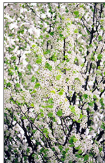
Bradford Ornamental Pear flowers