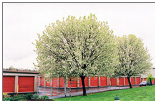
Bradford Ornamental Pear in bloom

Bradford Ornamental Pear is recommended for the following landscape applications;