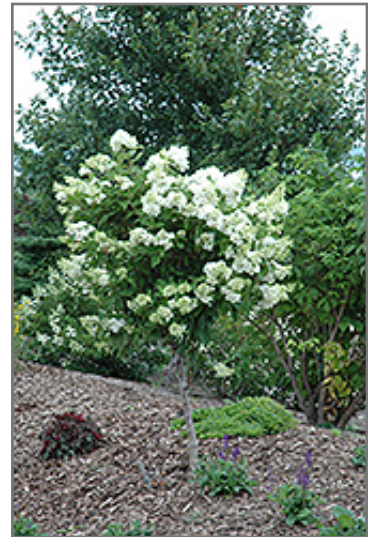
Pink Diamond Hydrangea (tree form) in bloom

Pink Diamond Hydrangea (tree form) will grow to be about 8 feet tall at maturity, with a spread of 6 feet. It tends to be a little leggy, with a typical clearance of 3 feet from the ground, and is suitable for planting under power lines. It grows at a medium rate, and under ideal conditions can be expected to live for 40 years or more.