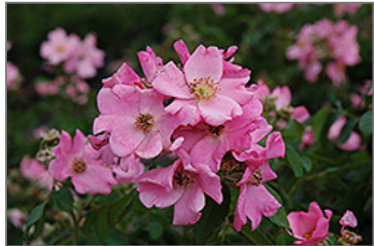
Polar Joy Rose flowers

Polar Joy Rose is recommended for the following landscape applications;