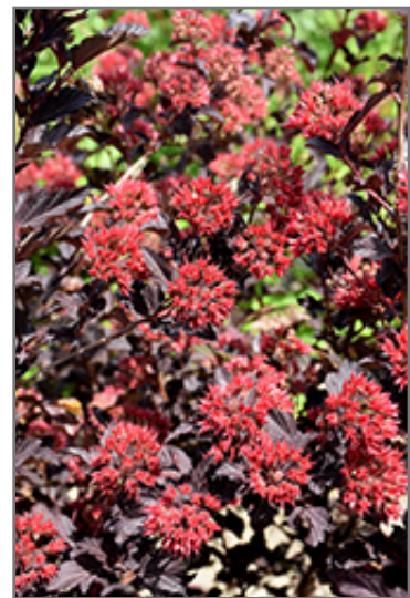
Center Glow Ninebark fruit