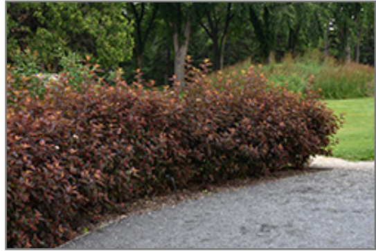
Center Glow Ninebark

This shrub does best in full sun to partial shade. It is very adaptable to both dry and moist locations, and should do just fine under average home landscape conditions. It is not particular as to soil type or pH. It is highly tolerant of urban pollution and will even thrive in inner city environments. This is a selection of a native North American species.