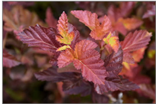
Center Glow Ninebark foliage

This shrub will require occasional maintenance and upkeep, and can be pruned at anytime. It has no significant negative characteristics.