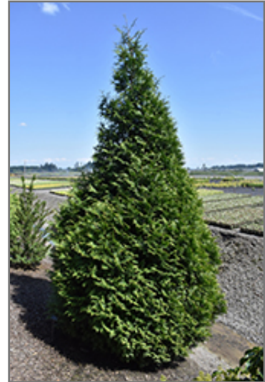
Tiny Tower Arborvitae

Tiny Tower Arborvitae will grow to be about 20 feet tall at maturity, with a spread of 5 feet. It has a low canopy, and is suitable for planting under power lines. It grows at a slow rate, and under ideal conditions can be expected to live for 50 years or more.