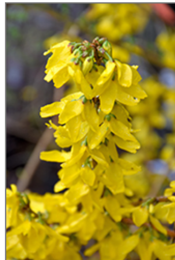
Magical Gold Forsythia flowers

Magical Gold Forsythia makes a fine choice for the outdoor landscape, but it is also well-suited for use in outdoor pots and containers. Because of its height, it is often used as a 'thriller' in the 'spiller-thriller-filler' container combination; plant it near the center of the pot, surrounded by smaller plants and those that spill over the edges. It is even sizeable enough that it can be grown alone in a suitable container. Note that when grown in a container, it may not perform exactly as indicated on the tag - this is to be expected. Also note that when growing plants in outdoor containers and baskets, they may require more frequent waterings than they would in the yard or garden.