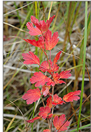
American Gooseberry in fall