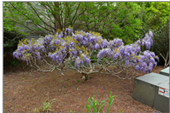
Japanese Wisteria in bloom