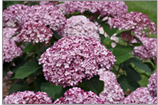
Incrediball Blush Smooth Hydrangea

This shrub does best in full sun to partial shade. You may want to keep it away from hot, dry locations that receive direct afternoon sun or which get reflected sunlight, such as against the south side of a white wall. It prefers to grow in average to moist conditions, and shouldn't be allowed to dry out. It is not particular as to soil type or pH. It is highly tolerant of urban pollution and will even thrive in inner city environments. Consider applying a thick mulch around the root zone in winter to protect it in exposed locations or colder microclimates. This is a selection of a native North American species.