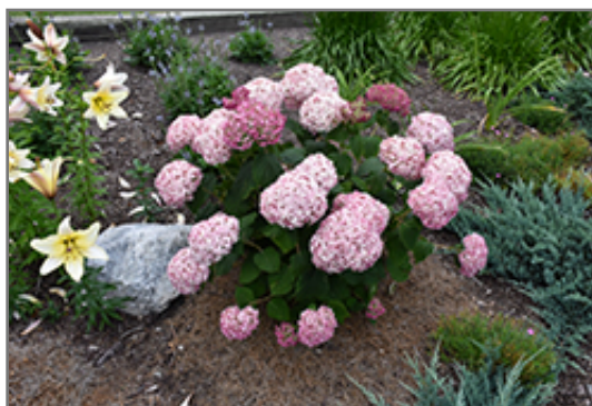
Incrediball Blush Smooth Hydrangea in bloom