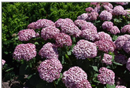
Incrediball Blush Smooth Hydrangea flowers