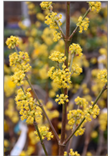
Sunrise Cornelian Cherry flowers