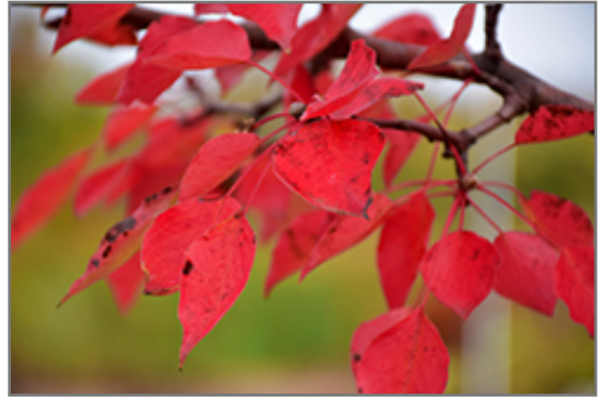
New Bradford Ornamental Pear in fall

* This is a 'special order' plant - contact store for details