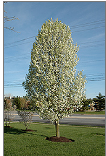
New Bradford Ornamental Pear in bloom