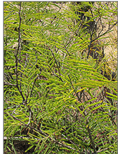
Desert Fern foliage