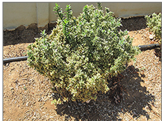
Variegated Boxleaf Japanese Euonymus