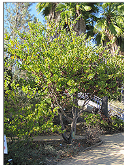
Western Redbud