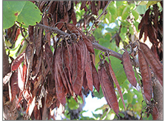
Western Redbud fruit

* This is a 'special order' plant - contact store for details