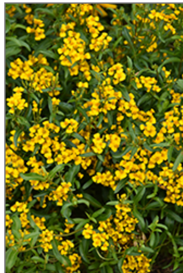
Mexican Tarragon flowers

Mexican Tarragon features showy yellow daisy flowers with gold eyes at the ends of the stems from late summer to early fall. Its attractive fragrant narrow compound leaves remain green in color throughout the season.