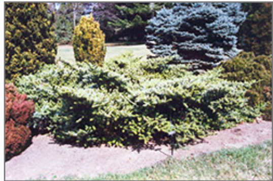
Compact Dwarf Korean Fir

Compact Dwarf Korean Fir will grow to be about 6 feet tall at maturity, with a spread of 10 feet. It tends to fill out right to the ground and therefore doesn't necessarily require facer plants in front, and is suitable for planting under power lines. It grows at a slow rate, and under ideal conditions can be expected to live for 60 years or more.