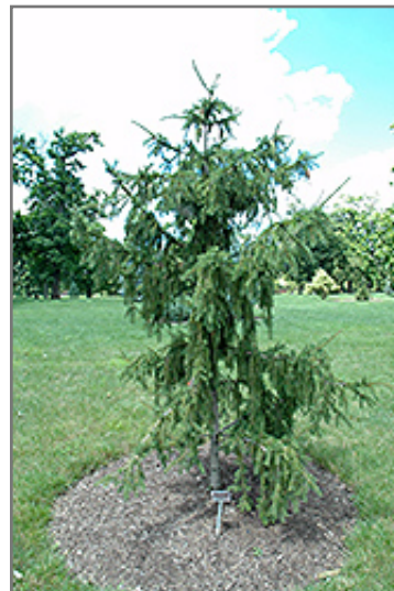
Red Tipped Norway Spruce

Red Tipped Norway Spruce will grow to be about 40 feet tall at maturity, with a spread of 20 feet. It has a low canopy with a typical clearance of 2 feet from the ground, and should not be planted underneath power lines. It grows at a slow rate, and under ideal conditions can be expected to live for 60 years or more.