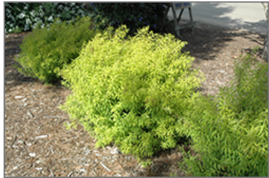
Mellow Yellow Spirea

Mellow Yellow Spirea is recommended for the following landscape applications;