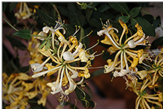
Scentsation Honeysuckle flowers