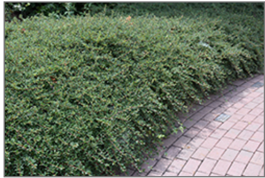
Coral Beauty Cotoneaster