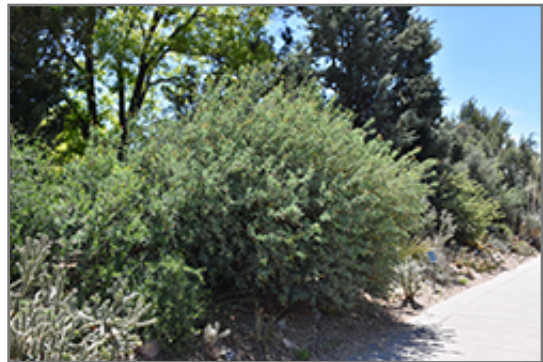
Fremont Mahonia in bloom