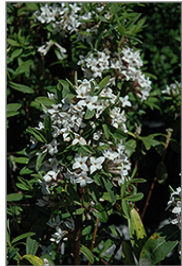
Jim's Pride Daphne flowers