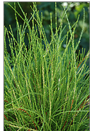
Franky Boy Arborvitae foliage