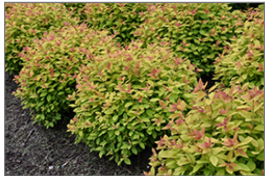
Double Play Big Bang Spirea