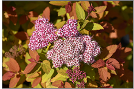
Double Play Big Bang Spirea flowers

This shrub should only be grown in full sunlight. It prefers to grow in average to moist conditions, and shouldn't be allowed to dry out. It is not particular as to soil type or pH. It is highly tolerant of urban pollution and will even thrive in inner city environments. This particular variety is an interspecific hybrid.