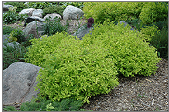
Goldmound Spirea