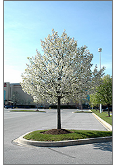
Jack Ornamental Pear in bloom