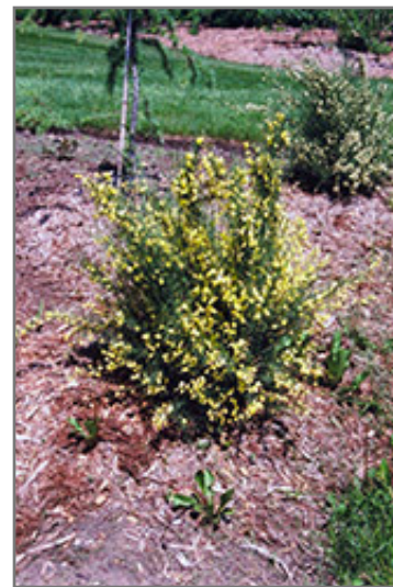
Scotch Broom in bloom