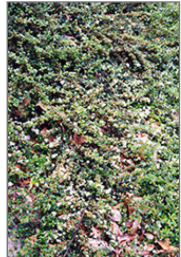
Spreading Cotoneaster

Spreading Cotoneaster will grow to be about 6 feet tall at maturity, with a spread of 7 feet. It tends to fill out right to the ground and therefore doesn't necessarily require facer plants in front, and is suitable for planting under power lines. It grows at a medium rate, and under ideal conditions can be expected to live for approximately 30 years.